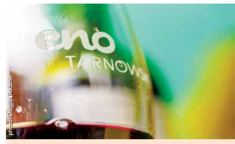
Local products are waiting for you