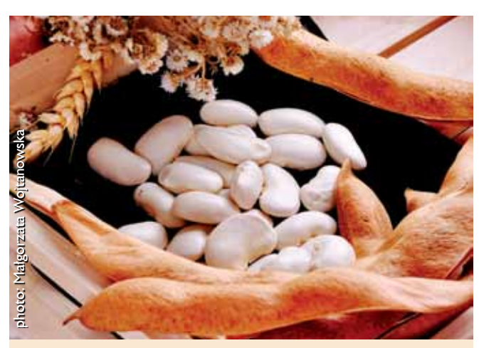
Piękny Jaś beans from the Dunajec Valley