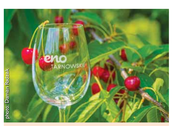
enoTARNOWSKIE cherry orchards

The previously mentioned Hetman Tarnowski was also interested in the development of beekeeping. He had significant beekeeping areas in Wierzchosławice and in the Black Forest adjacent to Żukowice, Luszowice and Żdżary. Beekeeping also developed in the forests Pogórze near Pogórska Wola. This