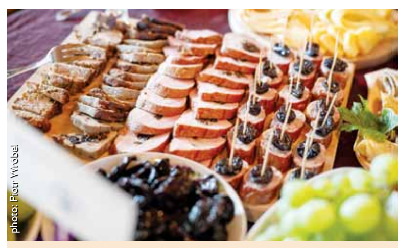
enoTARNOWSKIE Suska Sechlońska dried plum