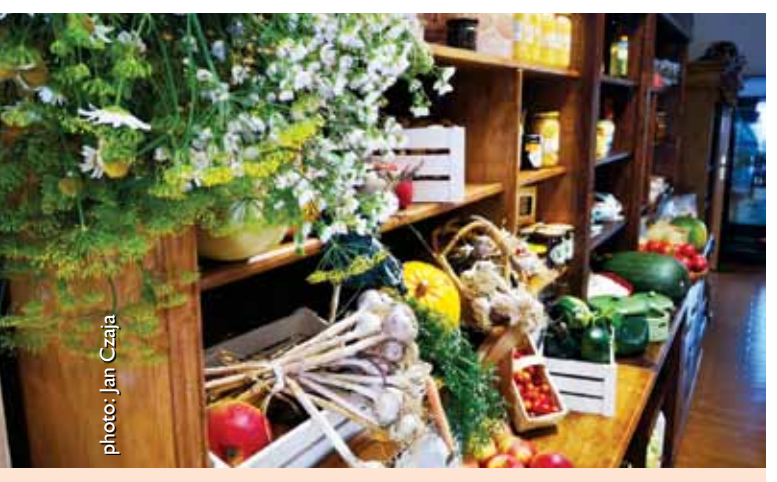
Local Product Centre in Rzuchowa

ingredient of cakes, but also, for example, of pierogi or... pizza and burgers. A legend from the Laskowa area has it that the local parish priest asked his parishioners to plant plum trees as a penance for their sins, and the fruit had to be dried because smoke-dried plums could not be made into slivovitz. Slightly sweet in taste, with a discernible aftertaste and a smoky aroma, it is the pride of four municipalities in Lesser Poland: Laskowa, lwkowa, Łososina Dolna and Żegocina.