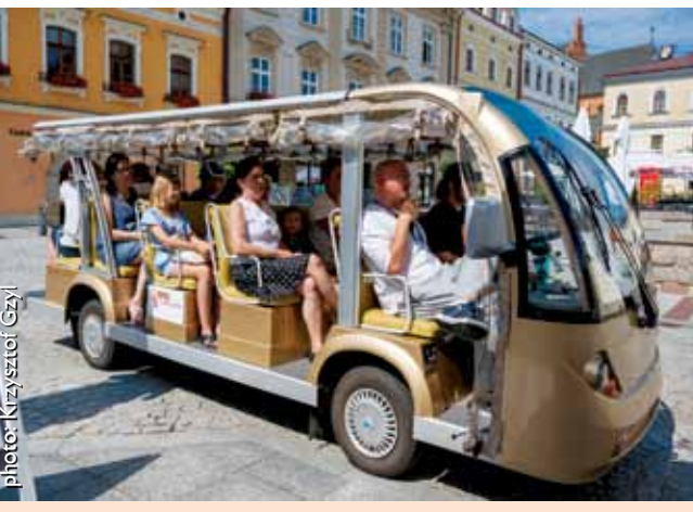
By Enomelex around Tarnów