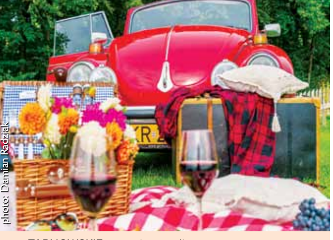
enoTARNOWSKIE - a unique culinary tour