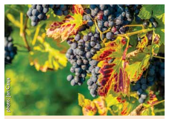
enoTARNOWSKIE – Winnicomania

And at the same time, you can visit one of dozens of vineyards, learn about the art of sommelier, taste wines and find out how to match the right wine with food. The region's flagship event is the annual Open Vineyard Days, where vineyards open their doors, inviting you to a different location every weekend. During the course, you can learn about the grape varieties, the history of the vineyard's origins, but also taste the best tipples.