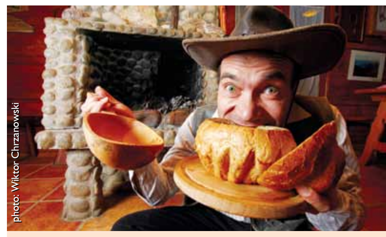
enoTARNOWSKIE - local products of the highest quality

Some venues serve only breakfast, others offer full board. Most venues have facilities for outdoor activities (children's playgrounds, fire pits, etc.), and many offer sports equipment for hire (e.g. bicycles, Nordic walking poles, badminton rackets).