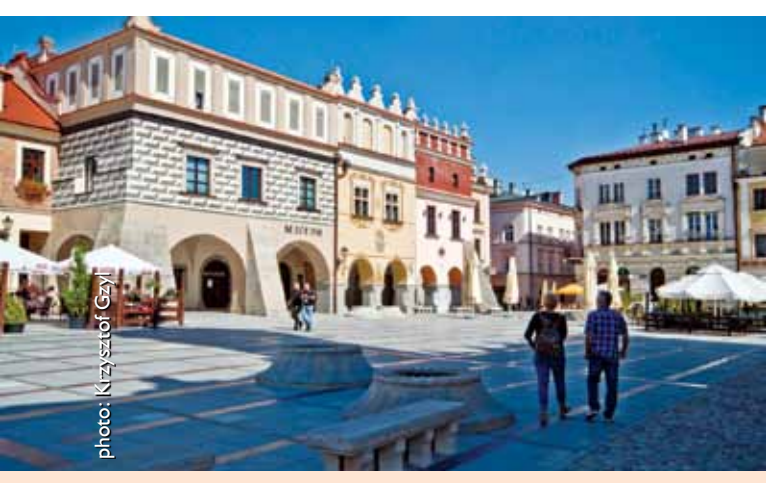
Renaissance townhouses on the market square in Tarnów