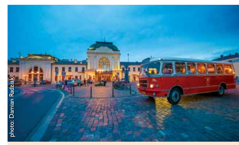
Historic bus in front of Tarnów railway station