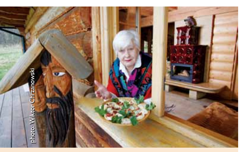
enoTARNOWSKIE – Open Vineyard Days

Festival or the Annual Pumpkin Festival in Rzuchowa in October. The season ends with the Great Tarnów Dionysia, which has been organised for ten years now, i.e. a several-day wine and winemakers' festival held in Tarnów in mid-November. It starts in the Old Town with a marching wine procession led by Saint Martin on a white horse and presentations of local vineyards. The programme of events is complemented by workshops on, for example, food and wine pairings.